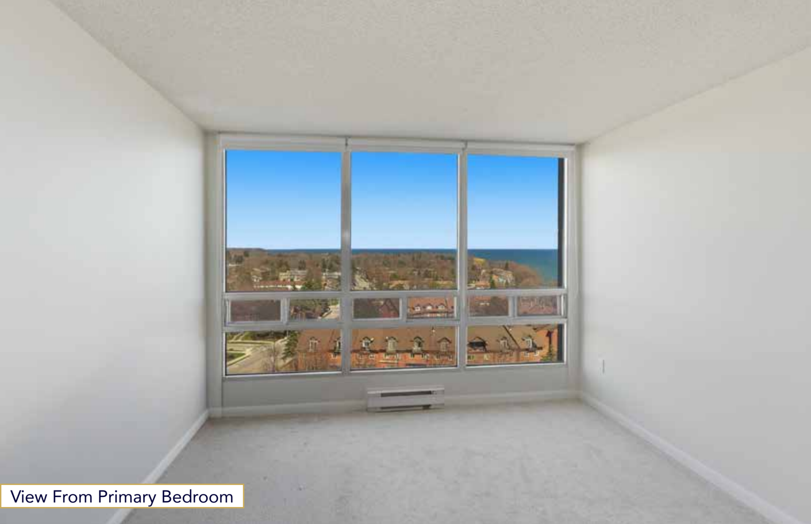
View From Primary Bedroom