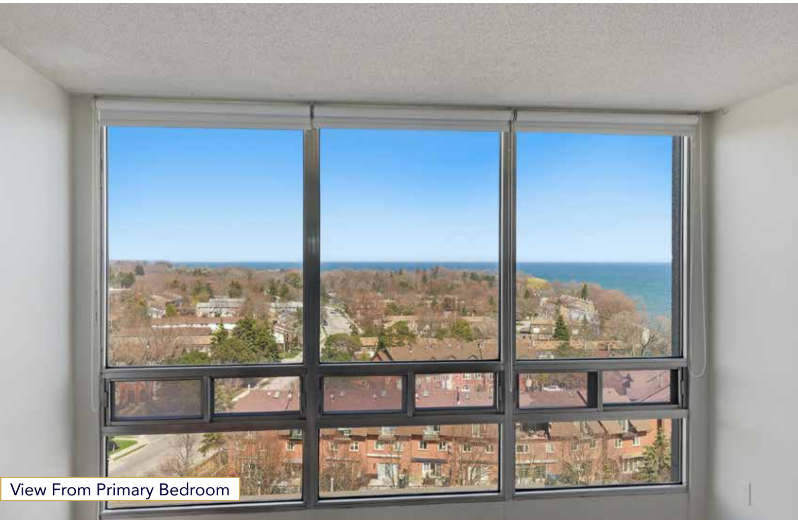
View From Primary Bedroom