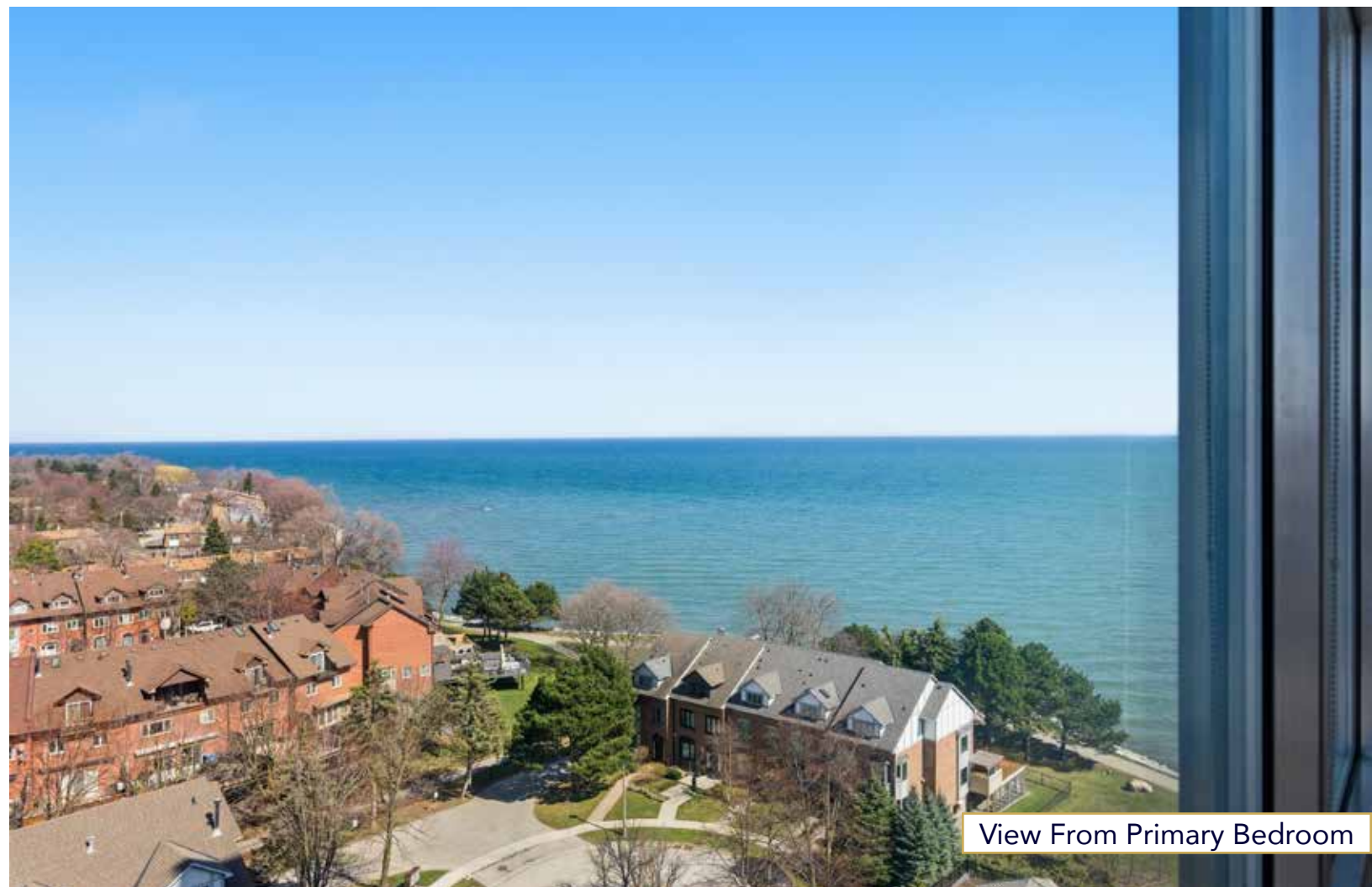
View From Primary Bedroom