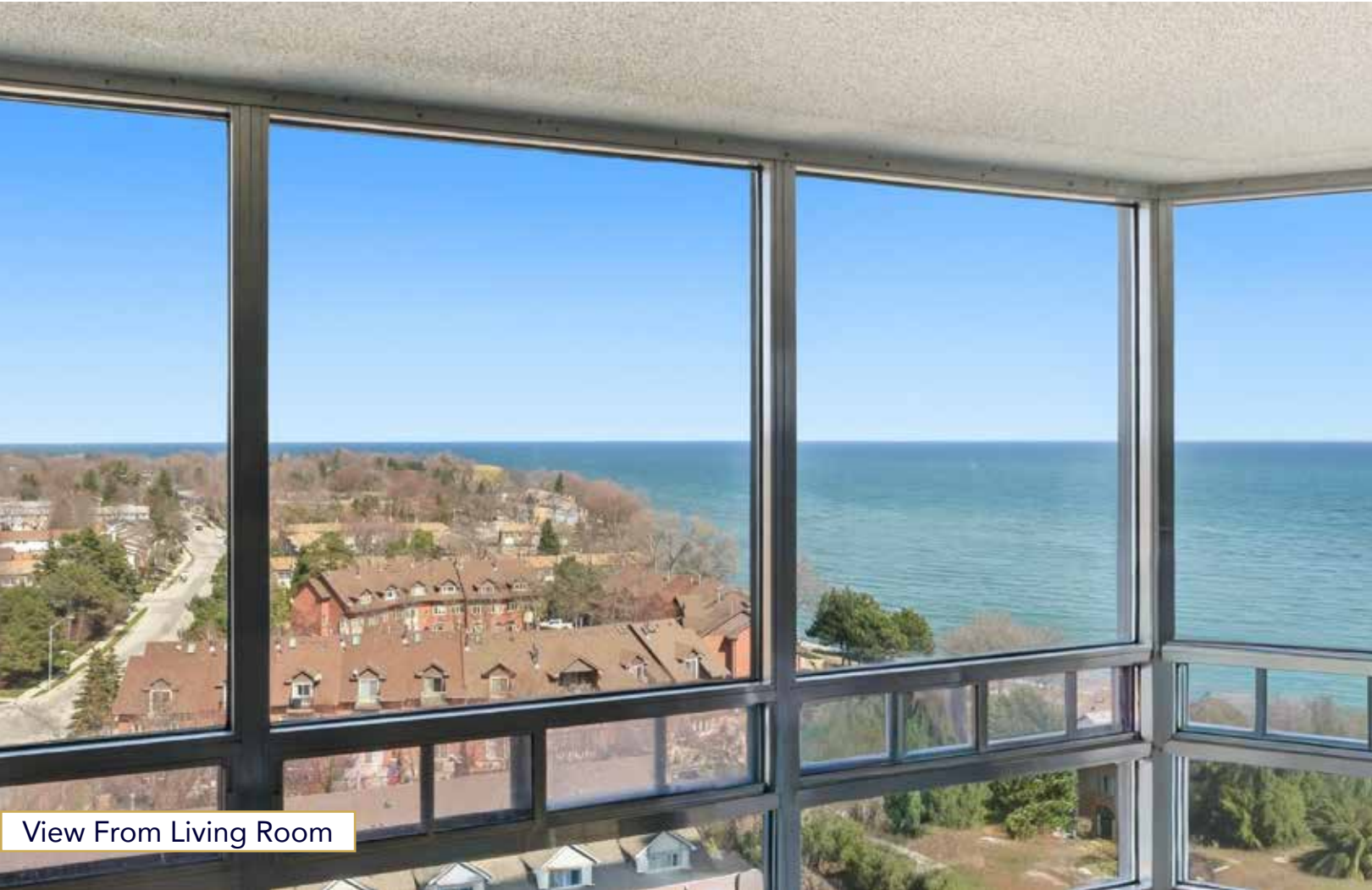
View From Living Room