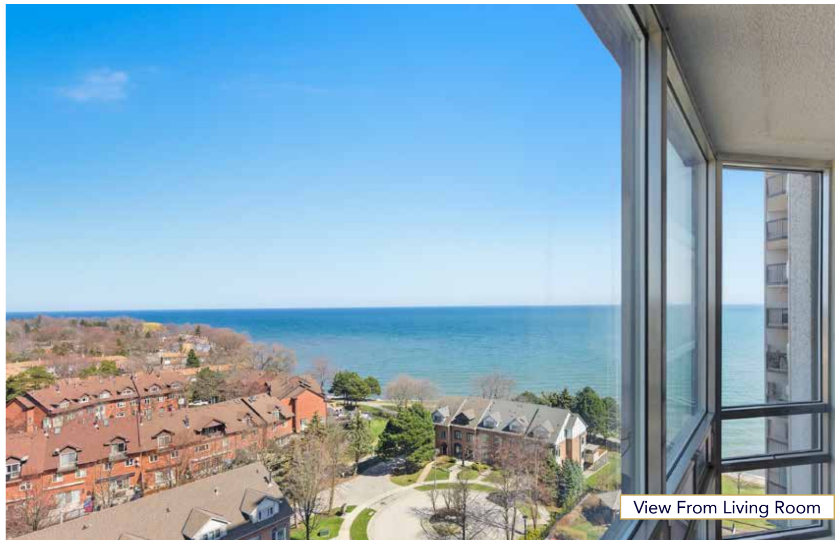
View From Living Room