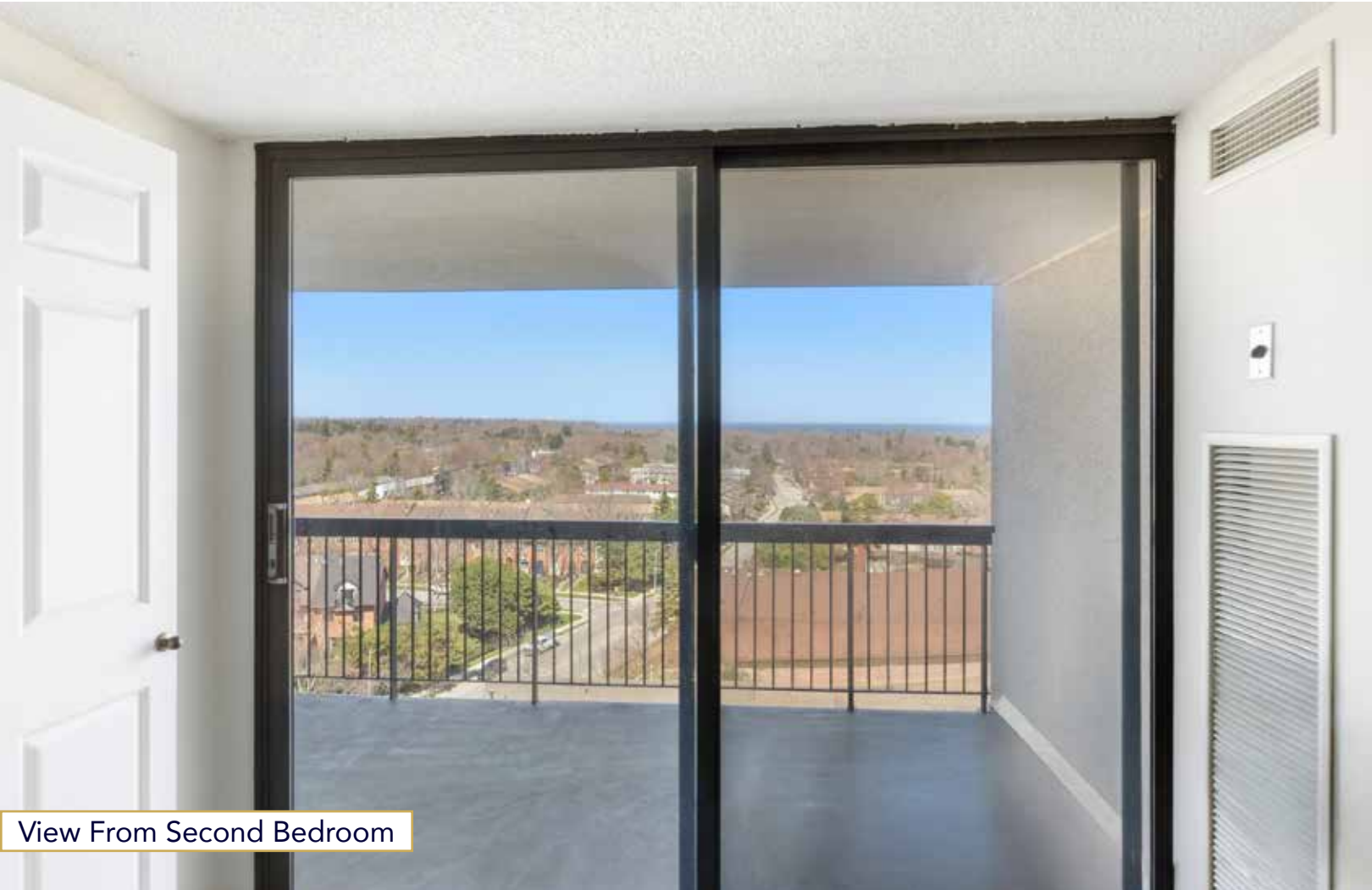
View From Second Bedroom