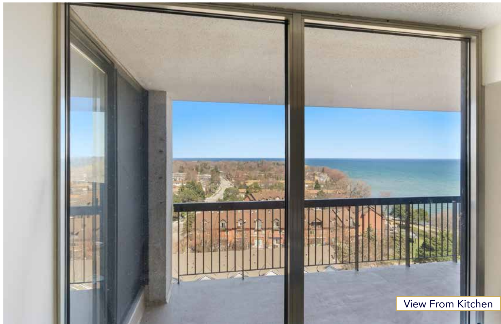
View From Kitchen