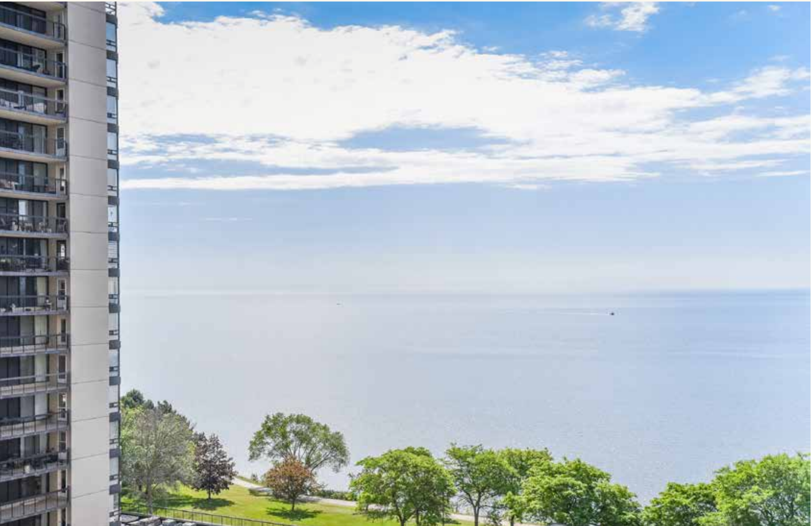
Gorgeous Lake View