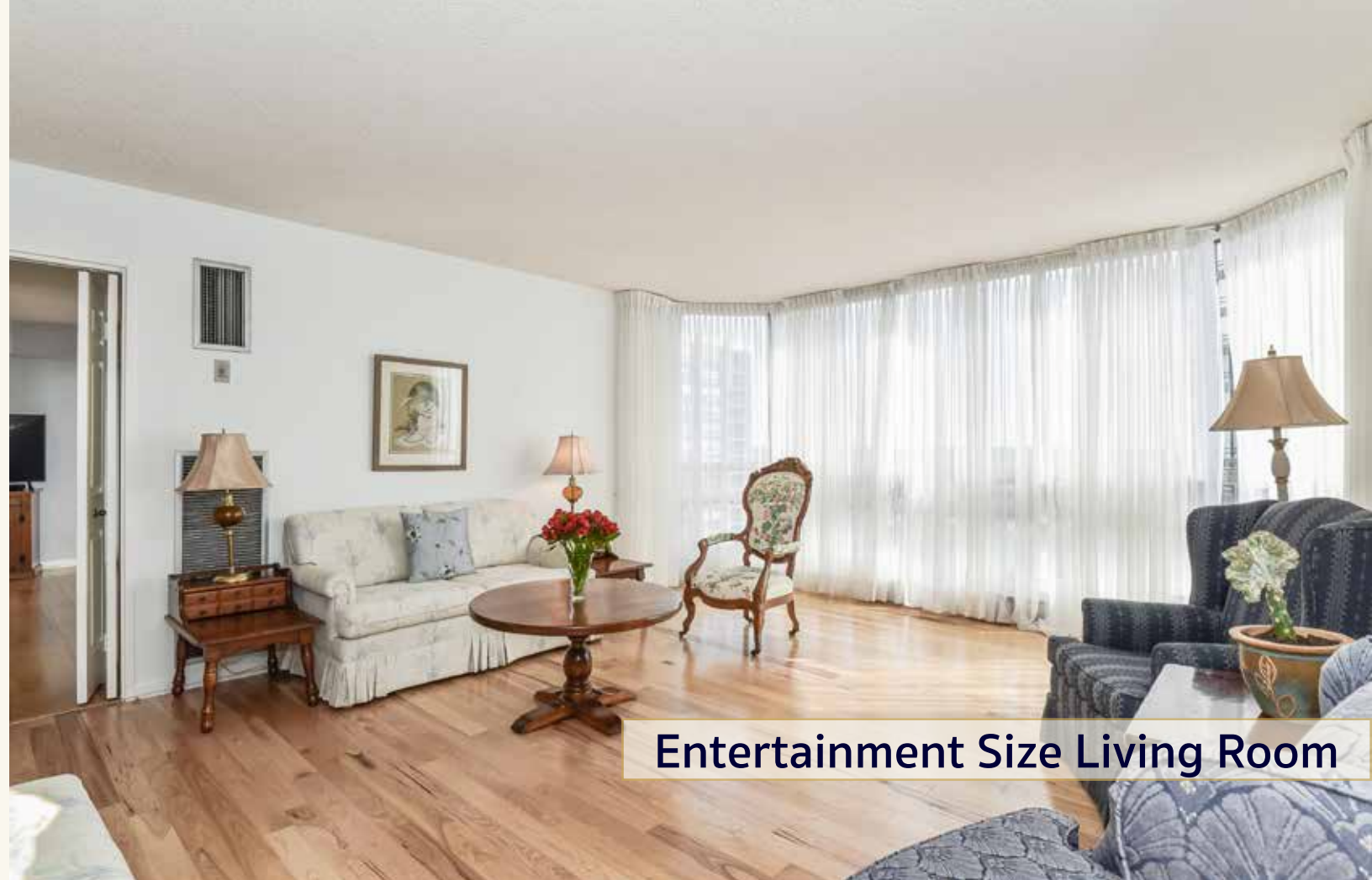
Entertainment Size Living Room