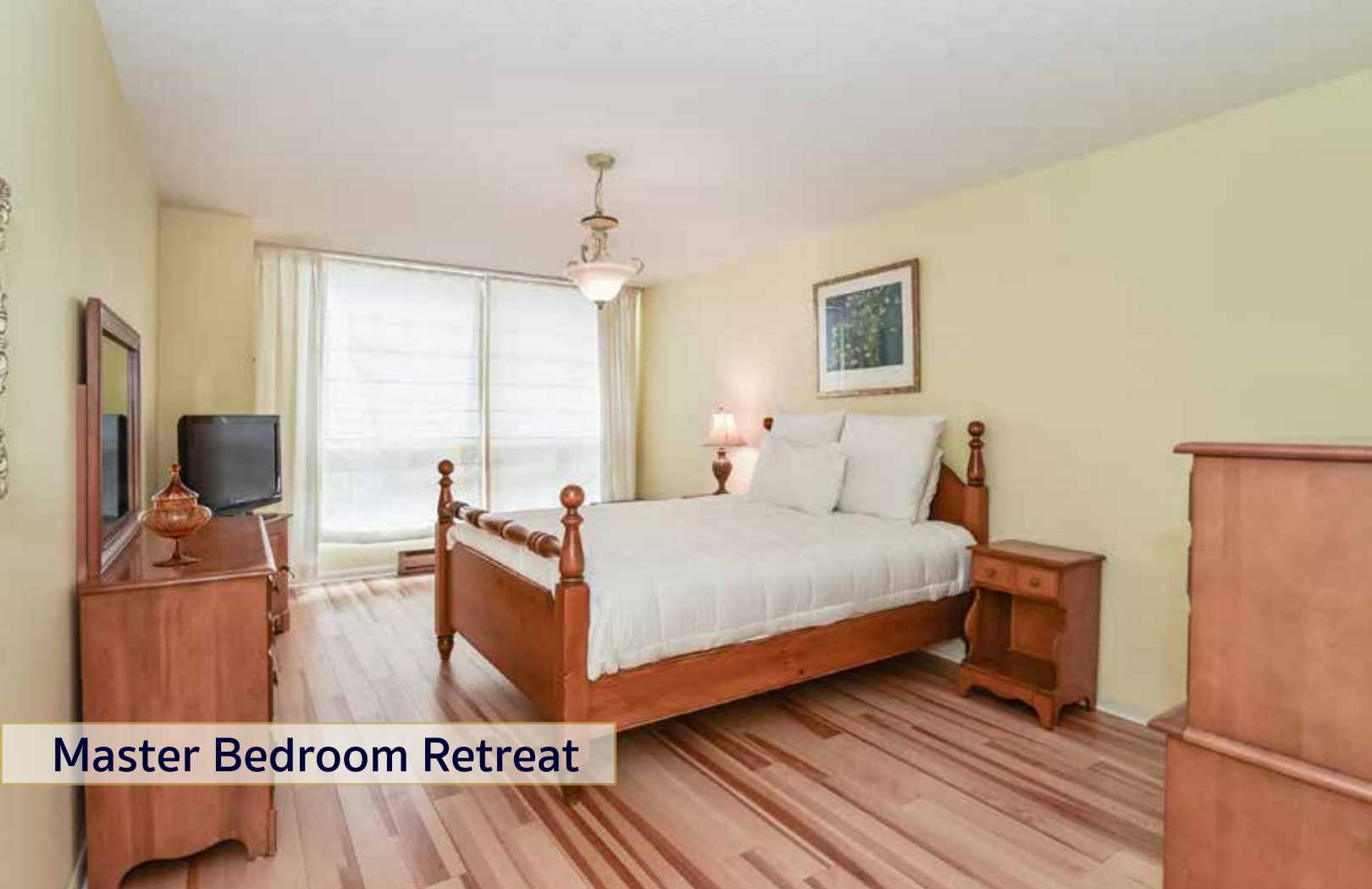
Master Bedroom Retreat